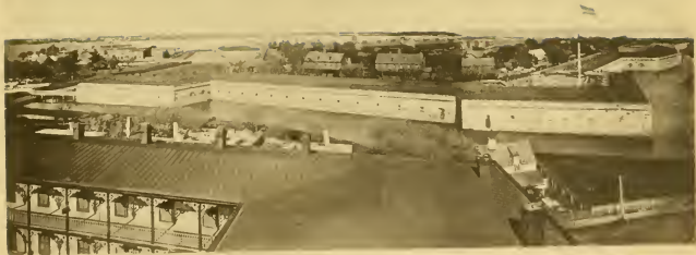
PANORAMIC VIEW OF FORT MONROE.